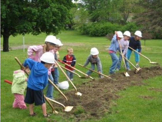
Emphasizing the community spirit of the project, future patrons of the Parkside Activities Center participate in the groundbreaking ceremony.